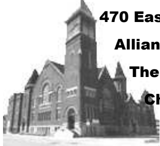
“The Church on The Hill”