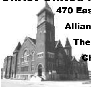
“The Church on The Hill”

TO SERVE GOD BY SHARING COMPASSION AND LOVE